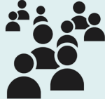
RECEPTION STYLE Tables for food only. No chairs.