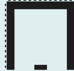
U-SHAPE Tables & chairs to form a U-shape.