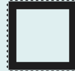
HOLLOW SQ. Tables & chairs to form a hollow square.